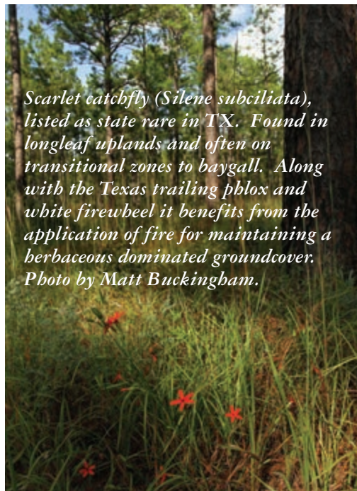
Scarlet catchfly ( Silene subciliata ), listed as state rare in TX. Found in longleaf uplands and often on transitional zones to baygall. Along with the Texas trailing phlox and white firewheel it benefits from the application of fire for maintaining a herbaceous dominated groundcover.