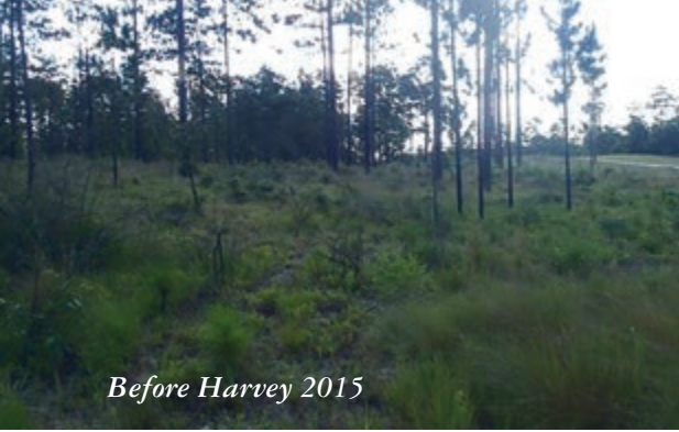
Before Harvey 2015