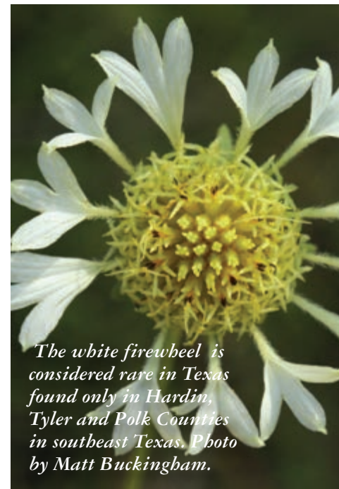
The white firewheel is considered rare in Texas found only in Hardin, Tyler and Polk Counties in southeast Texas.

detailed measurements from before the flooding meant that we could also understand how the flooding affected the trees.