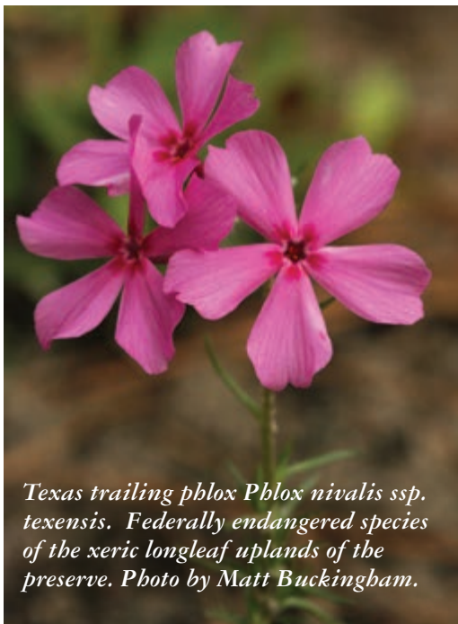
Texas trailing phlox Pblox nivalis ssp. texensis . Federally endangered species of the xeric longleaf uplands of the preserve.

Since 2015, avian surveys have been conducted at many of the vegetation monitoring plots where we are measuring the trees. Some of the most common birds heard before the flood